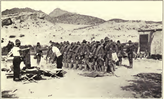
OFF FOR HOME